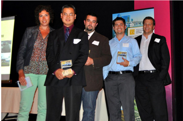
Vietnamese Youth Alliance - Black April Banners along El Cajon Boulevard