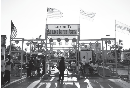
Celebration and installation of Little Saigon banners, supported by The Blvd, LS Foundation and SDSU Graphic Design class